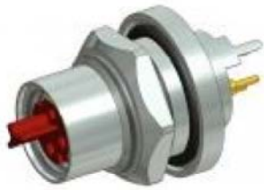
Part. No.: 42-01680 Sockets • M8x1 • 4- pos. • 10 mm • P-coding • Printanschluss • Shielded