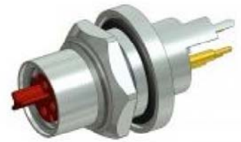
Part. No.: 42-01679 Sockets • M8x1 • 4- pos. • 6 mm • P-coding • Printanschluss • Shielded