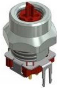
Part. No.: 42-01677 Sockets • M8x1 • 4- pos. • 9 mm • P-coding • Printanschluss • Shielded