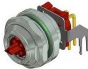
Part. No.: 42-01676 Sockets • M8x1 • 4- pos. • 12 mm • P-coding • Printanschluss • Shielded