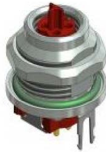
Part. No.: 42-01673 Sockets • M8x1 • 4- pos. • 6 mm • P-coding • Printanschluss • Shielded