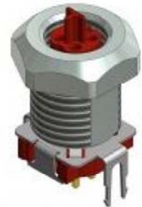
Part. No.: 42-01678 Sockets • M8x1 • 4- pos. • 13 mm • P-coding • Printanschluss • Shielded