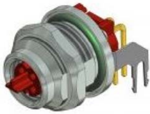
Part. No.: 42-01675 Sockets • M8x1 • 4- pos. • 8 mm • P-coding • Printanschluss • Shielded