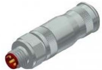
Part. No.: 42-13878 Male connector axial • P-coding • single ended • M8x1 • 4- pos. • 10 m • AWG22 • PUR • Shielded