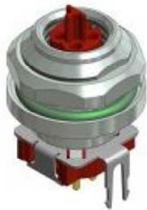
Part. No.: 42-01674 Sockets • M8x1 • 4- pos. • 10 mm • P-coding • Printanschluss • Shielded